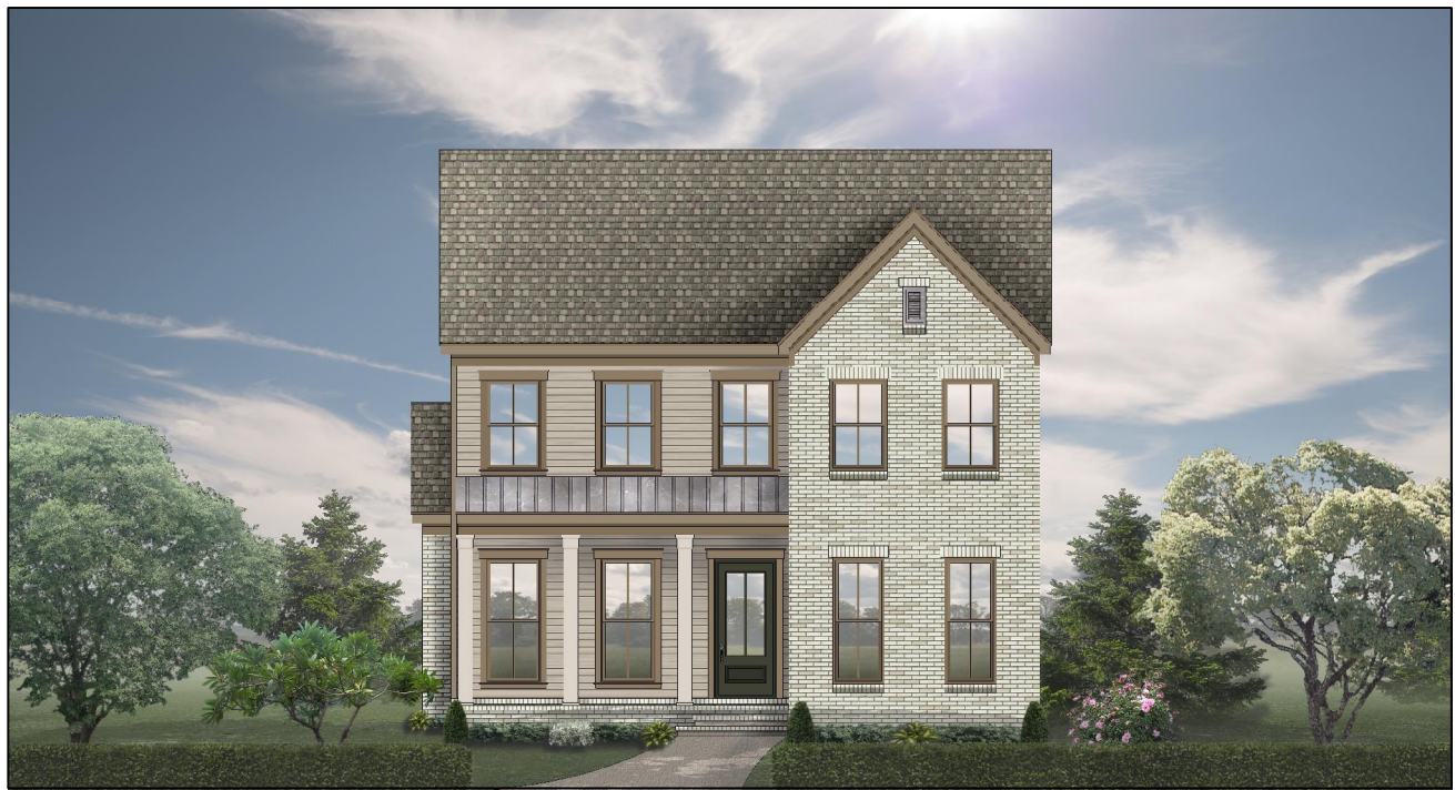
Photo or Rendering May Reflect Changes Made in Field.